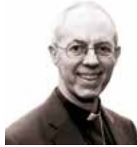
Justin Welby, Archbishop of Canterbury and CAP's patron

CAP are serious, highly professional, deeply committed and, above all, they will treat you as a human being of infinite value, who just needs some help to find your own way forward.